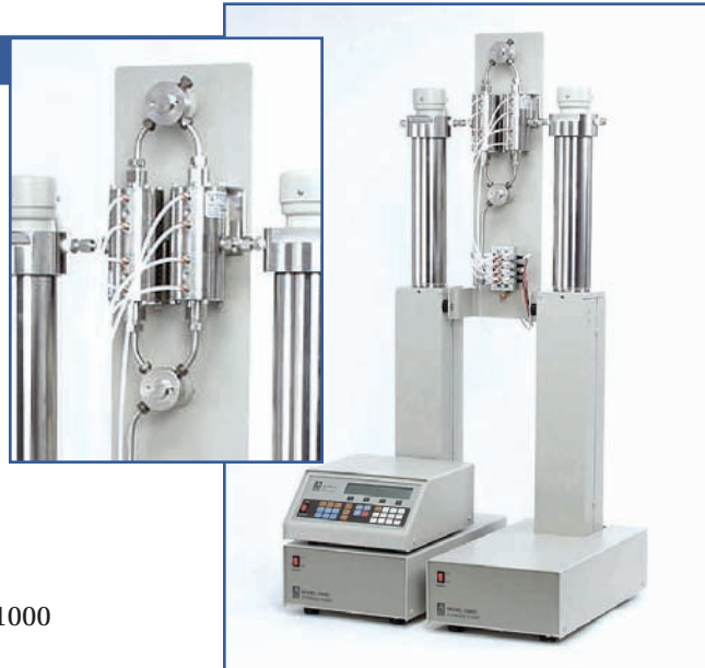
A1000 continuous flow system.