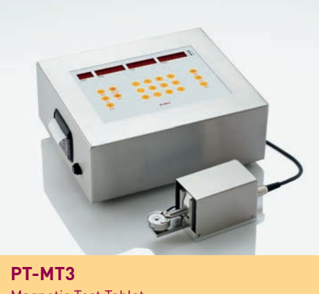
Magnetic Test Tablet