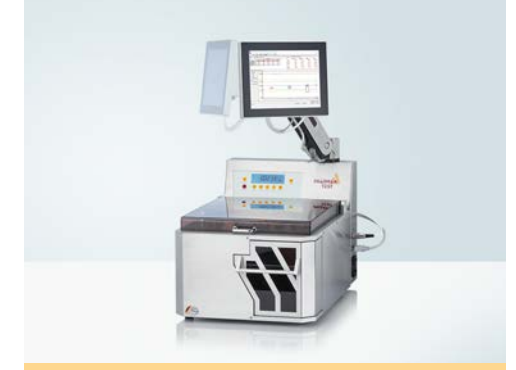
WHT 4 Fully-Automated Tablet Hardness Testing System