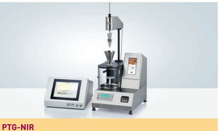
Powder Analysis System