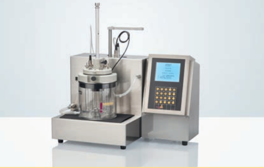
SPT-6 Suppository Softening (Penetration) Time Tester