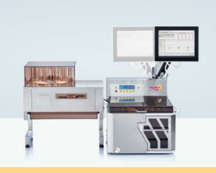
WHT 4-SM Multi-Batch Feeder