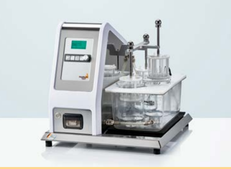
PTZ 100 / PTZ 300 Semi-Automated Disintegration Testers

Friability testing is used to test the durability of tablets during packing processes and transit. This involves repeatedly dropping a sample of tablets over a fixed time, using a rotating drum with a baffle. The result is inspected for broken tablets, and the percentage of tablet mass lost through chipping. All Pharma Test friability testers are fully compliant to the current USP and EP Pharmacopeia and come with friability ("Roche") drums included in the standard scope of supply. Abrasion drums as well as an anti-static coating are available as options. All PTF instruments support operation at a 10 degree angle to test larger samples by use of collapsible feet.